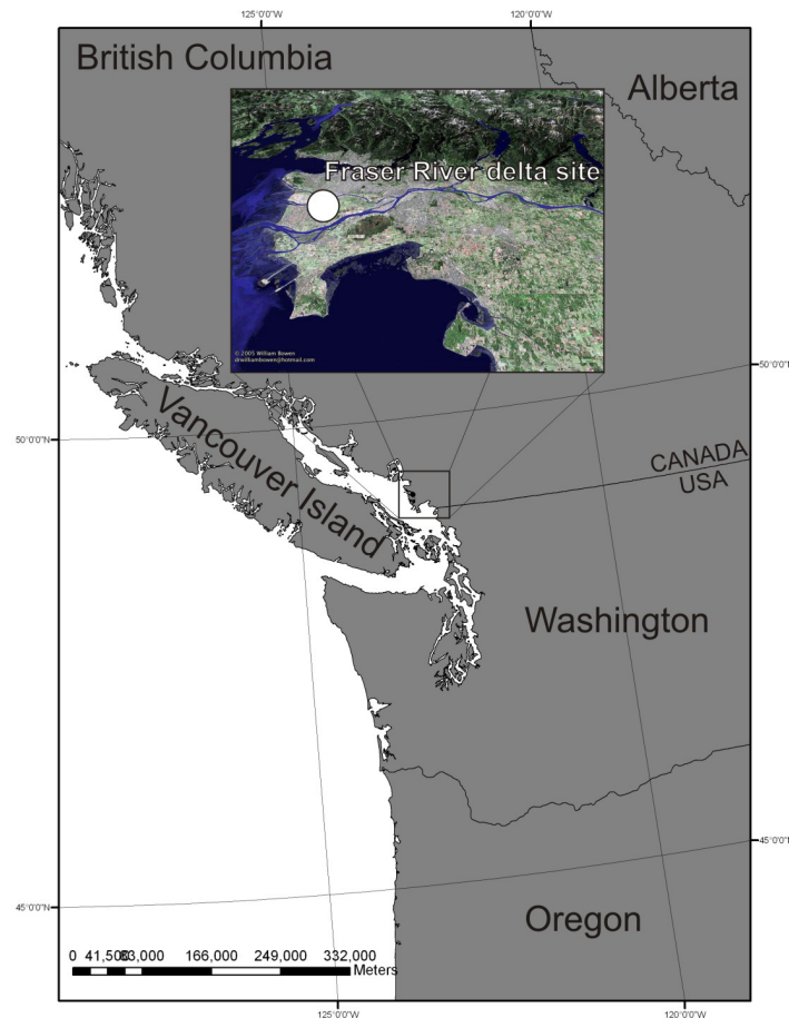
Figure 1. Location of the Fraser River delta. Microtremors were recorded at the position of the white circle (inset).

In this paper, we present the V_S profile (i.e. the optimal model) at a site on the Fraser River delta in southwest British Columbia estimated using Bayesian inversion of the dispersion curve determined from microtremor array measurements. Bayesian inversion considers the model to be a random variable constrained by data and prior information, and seeks properties of the posterior probability density (PPD) that represent optimal parameter estimates and parameter uncertainties. Defining an appropriate model parameterization is an important issue in inverse problems, which we address here using the Bayesian information criterion (BIC). The subsurface is modelled as a stack of horizontal and homogeneous layers characterized by four parameters: V_S , compressional-wave velocity, density, and layer thickness, overlying a uniform velocity half-space. Parameterizations considered include layers with constant velocities, constant velocity gradients, and power law gradients. The recovered V_S profile (with uncertainties) is compared with existing V_S -depth measurements made by down-hole and SCPT invasive methods.